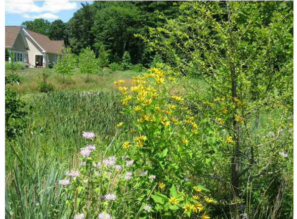
Naturalized Stormwater Basin at White Horse Village, Gradyville Road, in Edgmont.

Reduction of the amount of mowed lawn is a simple and cost effective way to achieve cleaner air, reduce downstream flooding, and protect future water supplies. A meadow of native warm season grass plants and native perennials does a better job of absorbing stormwater and reducing erosion than a closely cropped lawn does. These taller plants intercept more rainfall and overland flow and have much deeper roots- an average of four to ten feet deep vs. six inches for regular lawn. Stopping the routine mowing of wetter areas or sloped areas also avoids the compaction and stripping away of important vegetation which can cause the soil to erode, or hold water and become mosquito habitat.